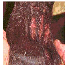
Oozing from pastern