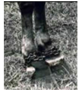
Double chains, and stack are being used to achieve the “Big Lick” gait.

HSUS and AAEP are in complete agreement with these suggested changes. August 8, 2008, HSUS announced a $10,000 reward for any information leading to arrest and convictions of the Tennessee violators of the “horse soring” laws. If you would like to report any information about soring practices, you may call 1-866-411-8326. Your name will be protected by HSUS. HSUS and other horse industry groups form, “The Alliance to End Soring”. The Alliance intends to work with the USDA, Congress and Tennessee walking horse industry to raise public awareness.