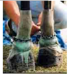
Horse wearing chains, stacks and a chemical solution applied

Over the years, the USDA has overseen the inspections for soring. They have found many cases of non-compliance with HPA. According to the HAP, You may not transport to or enter a “purposely” sored horse into events, shows or sales. This decision was upheld by the 6 th Circuit Court of Appeals. Court documents stated, a