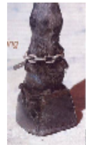
Stacked shoe with a chain on pastern.

In 1970 Congress passed the Horse Protection Act (HPA). HPA was intended to eliminate the horrid practice of “soring”. Despite this, soring continues almost unabated. The Tennessee Walking Horse industry is the leading offender, however, other gaited horse breeds like the Racking Horses, and Spotted Saddle Horses are suffering from these barbaric practices.