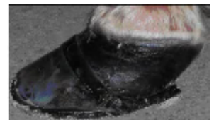
Example of sore shoeing.

During two days of meetings, the Walking Horse Trainers’ Association (WHTA) has recommended the removal of the National Horse Show Commission (NHSC) as the HIO. WHTA suggests the Tennessee Walking Horse National Celebration implement their own HIO named SHOW. SHOW will be responsible for taking over NHSC’s functions. On