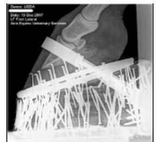
USDA X-rays of pressure shoeing with stacks.