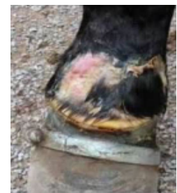
Injuries caused by soring.