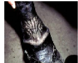
This horse has severe scarring indicative of soring.

Soring is caused by several methods. Most common is the application of caustic or irritating chemicals (like Salicylic Acid, Mustard Oil, Fuel Oil as well as other Petroleum products, see Photo #5) on pasterns. The chemicals cause horrific burns which can cause the death of some horses. After this “treatment” scarring is left on the pasterns, and coronet bands. Due to the United States Department of Agriculture’s (USDA) No Scarring rules, owners will try to hide scarring. The No Scarring rule states; any horse born after October 1, 1975 will be inspected for evidence of “soring”. Soring is indicated by missing hair, scars, or cuts. A treatment for trying to hide the scarring is Salicylic Acid. This acid will burn off the scarred skin. This use of Salicylic Acid is a very painful even with pain medications. The horse will be "scar free" but the treated area will be thicker and is sparsely haired, hence leaving evidence of past scarring sessions.