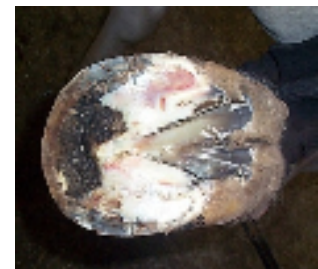
Example of pressure shoeing. Notice, the pink areas. This shows how closely the hooves are being trimmed.